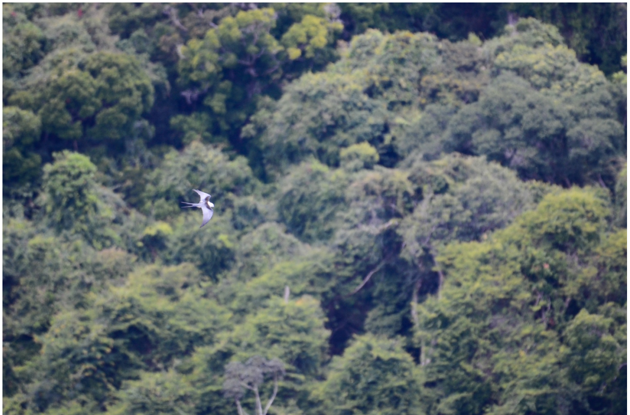
Photo: Swallow-tailed Kite