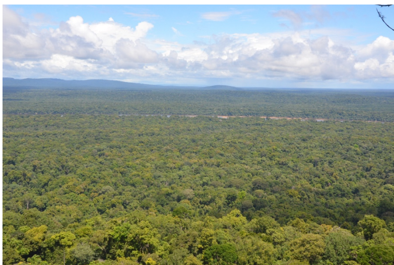
PHOTO: VIEW FROM TURTLE MOUNTAINS